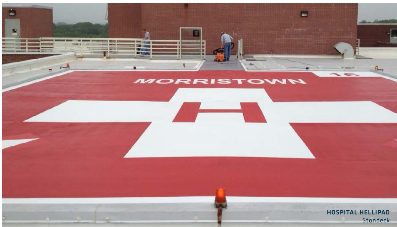
HOSPITAL HELLIPAD Stondeck

Seamless is more hygienic. With no grout lines or welds there's nowhere for bacteria to gather, grow and compromise hygiene. So no seams and no joints in the floor supports infection control practices and keeps your environment safe. It makes cleaning much easier too.