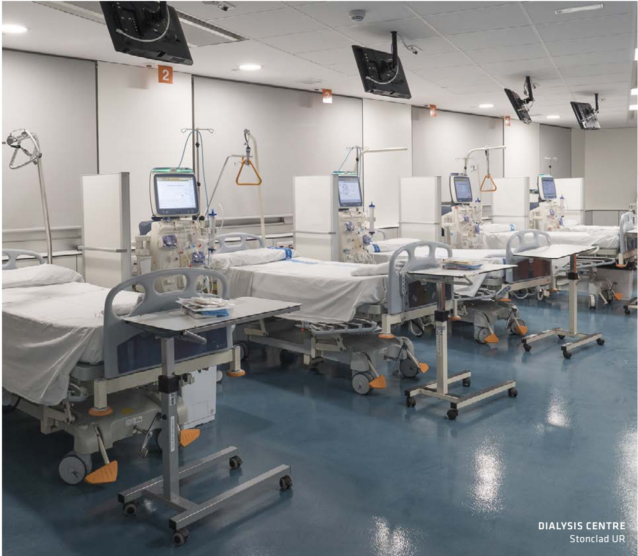
DIALYSIS CENTRE Stonclad UR