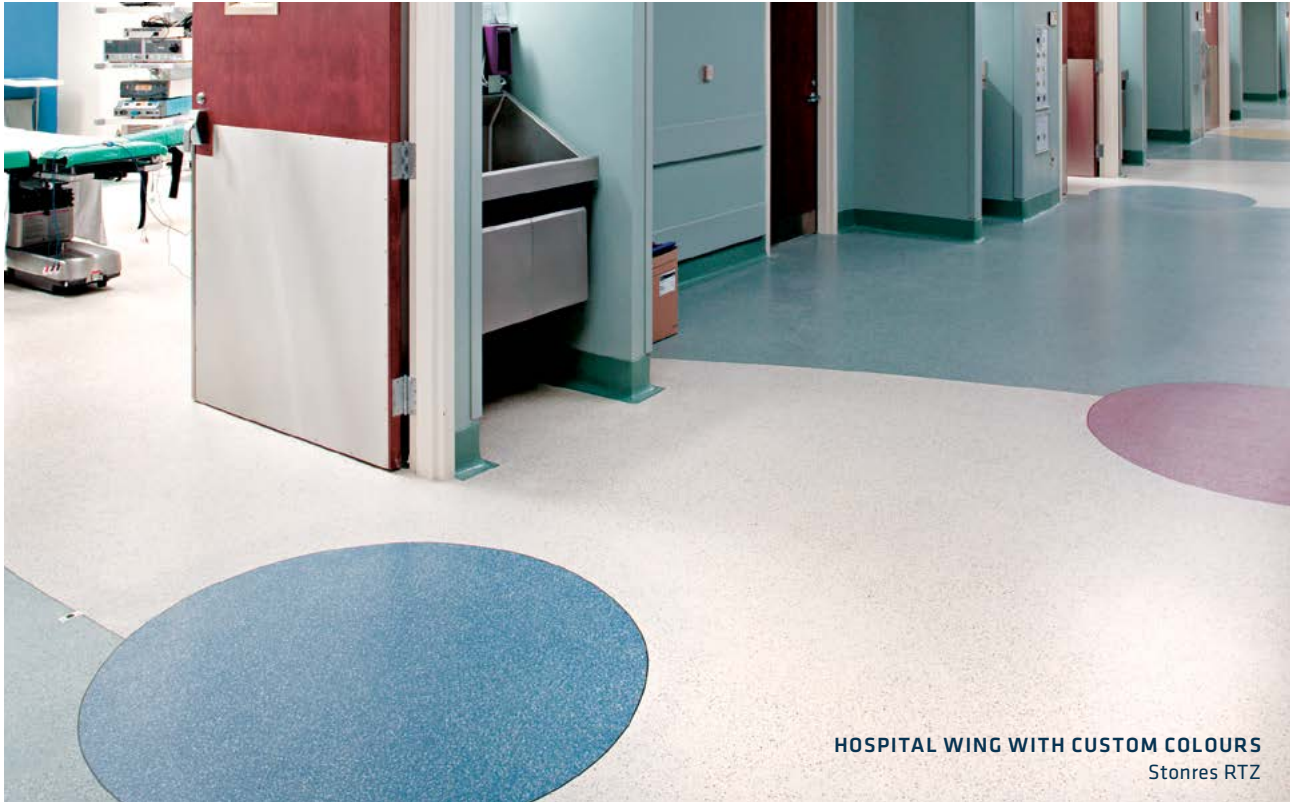
HOSPITAL WING WITH CUSTOM COLOURS Stonres RTZ